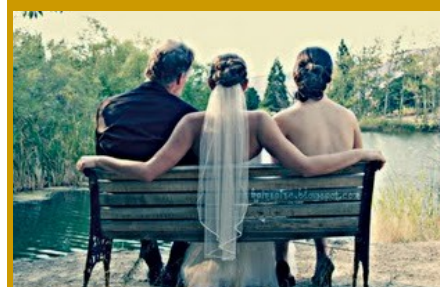
Photo taken on grounds overlooking pond...

Staff went above and beyond, recommending vendors, hotels, taxi services, anything we requested. The staff, and especially Kristen made the whole night calm and worry free. We loved it! It was beautiful! We were so happy to find you guys!! - Johnson Wedding September 2011