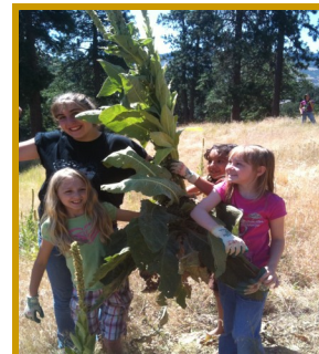
Grounds clean-up by the Gorge Explorers.

Our volunteers were also a crucial part of hosting the Commemoration of the 25th Anniversary of the National Scenic Act and the Holiday Open House.