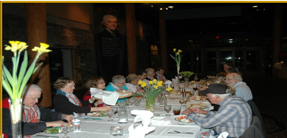
Our donors feasting on crab at our Annual VIP Event in January 2012!

In recognition of all of the donors listed above, we held our annual VIP Event in January 2012. After having to cancel the event on a Saturday night due to snow storms and power outages at the Discovery Center, we were thrilled they were able to attend the following evening. The menu consisted of fresh Dungeness Crab delivered from Astoria, OR., piping hot bread, pesto pasta salad, corn salad, and apple citrus salad. We also indulged them with desserts made by the Discovery Center staff.