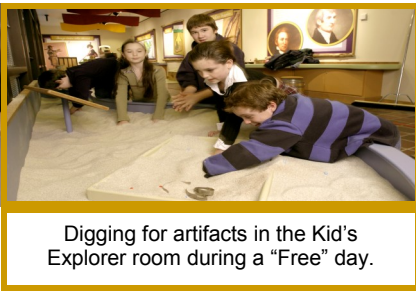
Digging for artifacts in the Kid's Explorer room during a "Free" day.

Ensuring that the Discovery Center is available to everyone regardless of income level, we provided many opportunities for free or reduced admission throughout the year. Our community days included Mother's Day, Father's Day, Holiday Open House, and Spring Break for both Oregon and Washington children and offered free admission. Fort Dalles Days brought the opportunity to allow rodeo ticket holders a 2 for 1 admission price while the Blue Star Museums Program offered free admission for active military families. Family Day passes were also made available for check-out at The Dalles-Wasco County Library.